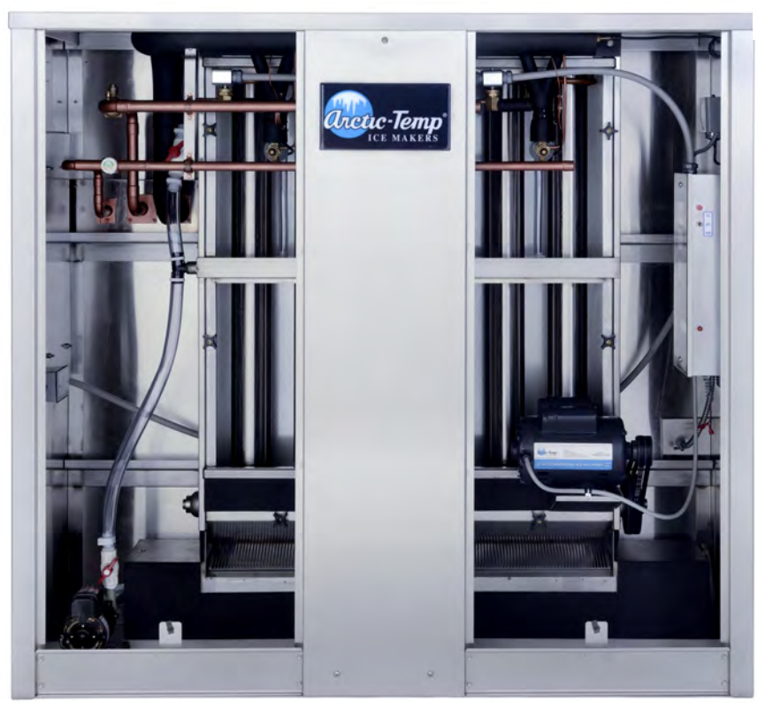
Shown with EZ lift panels removed