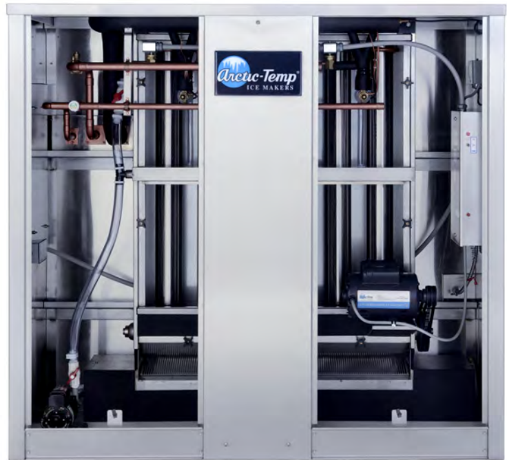
Shown with EZ lift panels removed