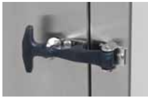
NEW EASY ACCESS LATCHES